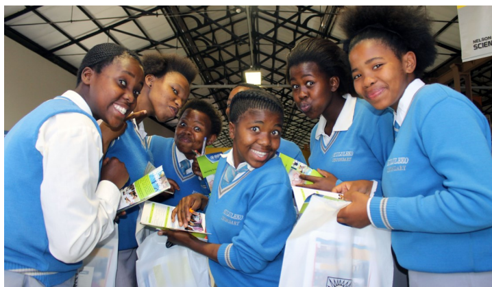
ABOVE: Students enjoying the CEIA Career Exhibition in Uitenhage.