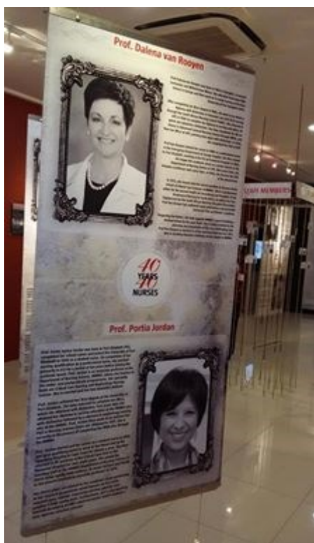
LEFT: Recognising nurses who have excelled since the inception of the Department of Nursing Science at UPE/NMMU.