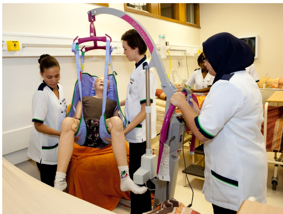
LEFT: A photo depicting one of the Department of Nursing Science's simulation laboratories with a manikin.

Delegates from the Democratic Republic of Congo (DRC) attended a week-long simulation workshop in the simulation laboratories at NMMU Department of Nursing Science. The aim of the visit was for the delegates to learn more about simulation education and how to apply it as a teaching and learning strategy. The delegates were excited about the best practices implemented in the Department of Nursing Science and will take their newly acquired knowledge back to the DRC, thereby contributing positively to simulation-based education in Africa.