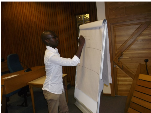
ABOVE: First year nursing students playing Pictionary. RIGHT: Nursing Society students for 2015.